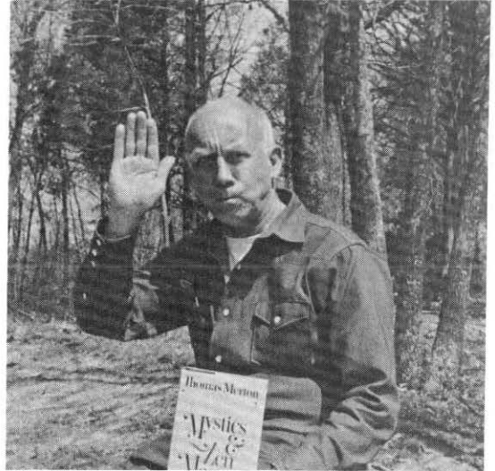
Merton at Gethsemani