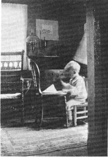
Young Tom Merton, photographed by his mother (1919)