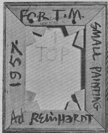
Reverse of Black Cross Painting, by Ad Reinhardt Lettering by Ad Reinhardt