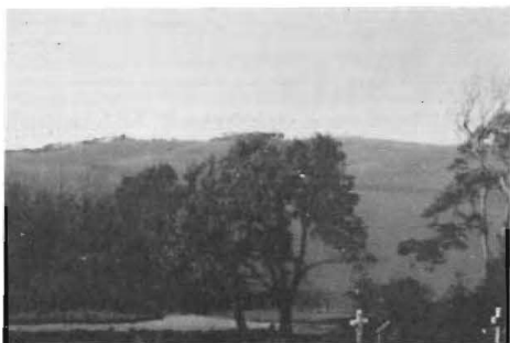
View from Brooke Church. In Merton's time this view would have been obscured by trees which were destroyed in a hurricane force gale in 1987