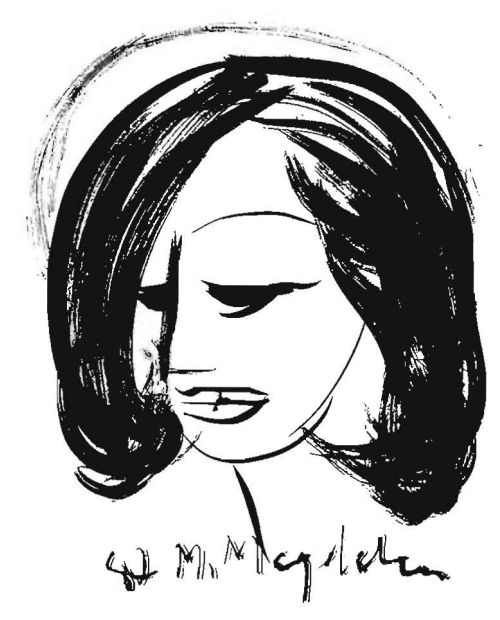
ST. MARY MAGDALEN DRAWING BY THOMAS MERTON