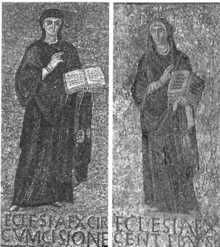
Santa Sabina Mosaics

the telephone book provided my basic information. However, because of multiple temporary barricades protecting new archeological sites, I circled the Forum three times before gaining access to St. Maria Nova – now renamed St. Francesca Romana. Having found Sts. Cosmas and Damian tucked into a corner of the Fori Imperiali, I saw the startling blue mosaic of the Last Judgment above the main altar – Merton’s favorite. Then off to St. Maria in Cosmedin with its ancient mosaic above the vestment case in the sacristy – now turned into the gift shop – and the hot, uphill trek to Santa