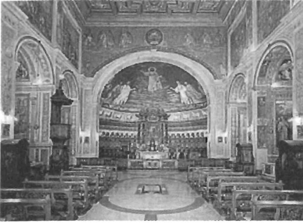
Church of Sts. Cosmas and Damian

Sabina to which Merton fled the morning after the emotionally-wrenching vision of his dead father ( SSM 111-13).